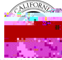
CALIFORNIA COMMUNITY COLLEGES